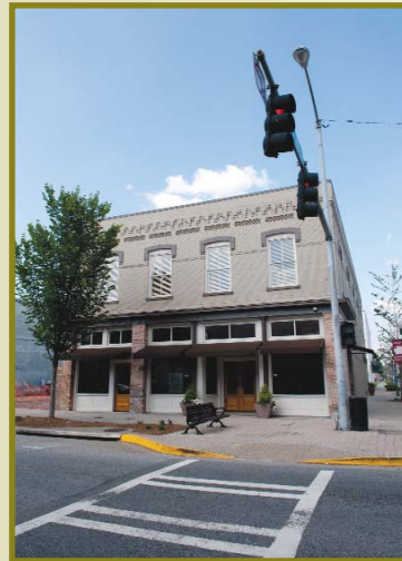
Newly renovated CJB Headquarters